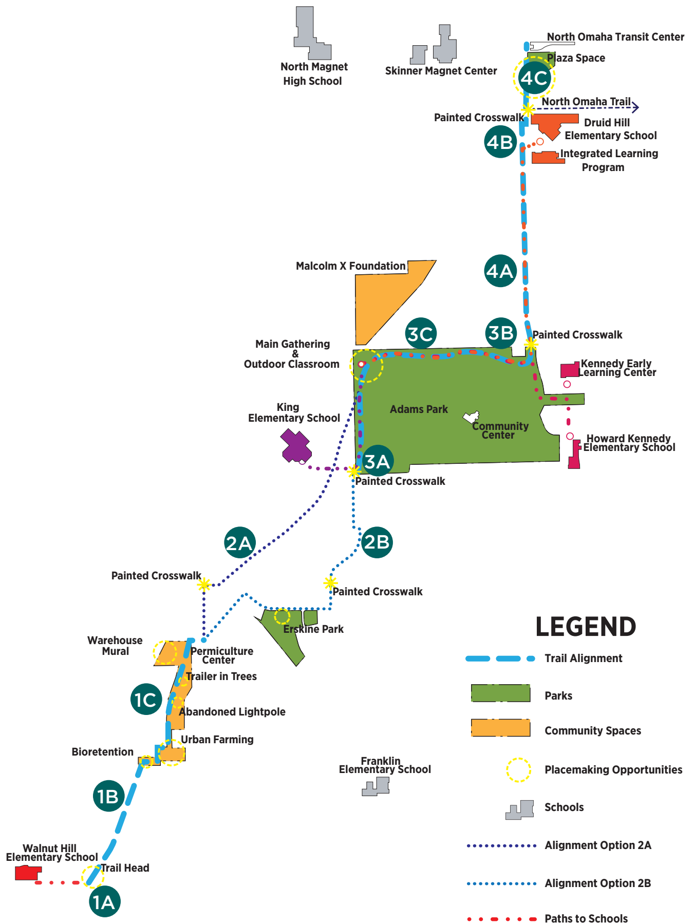
Illustration: Trial Alignment